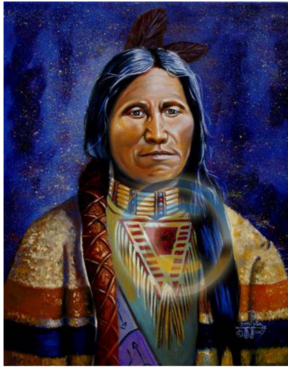
American Horse, original artwork By Leonard Peltier