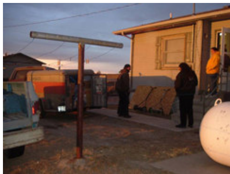
Final Destination- Oglala