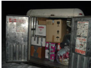
Our trailer getting ready for the trip to Pine Ridge!